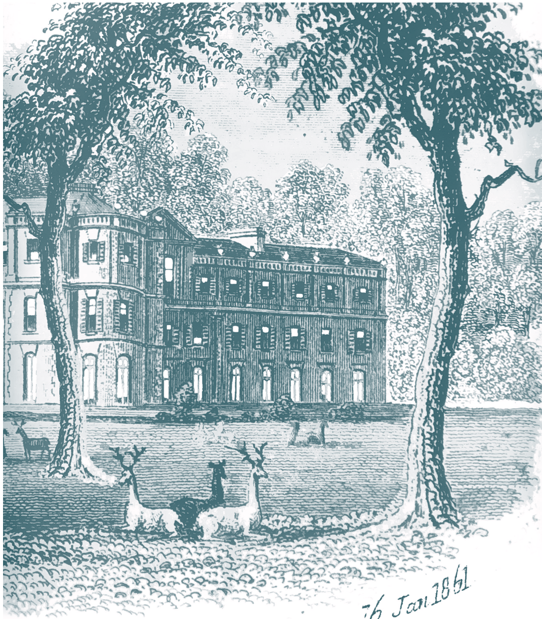
The Grove, Watford, Herts. Seat of the Earl of Clarendon